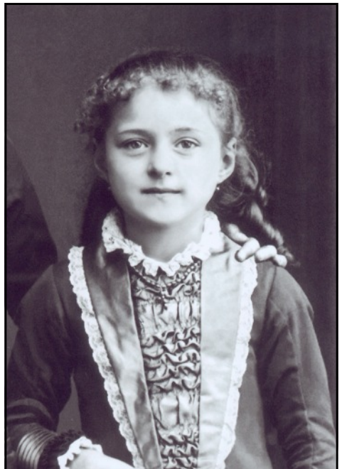
St Therese aged eight

St Therese was born in France nearly 150 years ago, the youngest of five sisters and she became the special pet of the family. All the girls were taught by their mother to love God so well that Therese from 3 years old wanted to live in a convent and pray all day! As a child she delighted in her home, loved her toys and games but above all she loved collecting flowers and making bouquets to adorn the statue of Our Lady the family had in their home. Roses were her favourite flower.